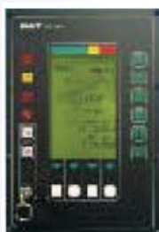
DS350 Graphic Modular Console (vertical)