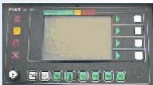
DS350 Graphic Modular Console (horizontal)